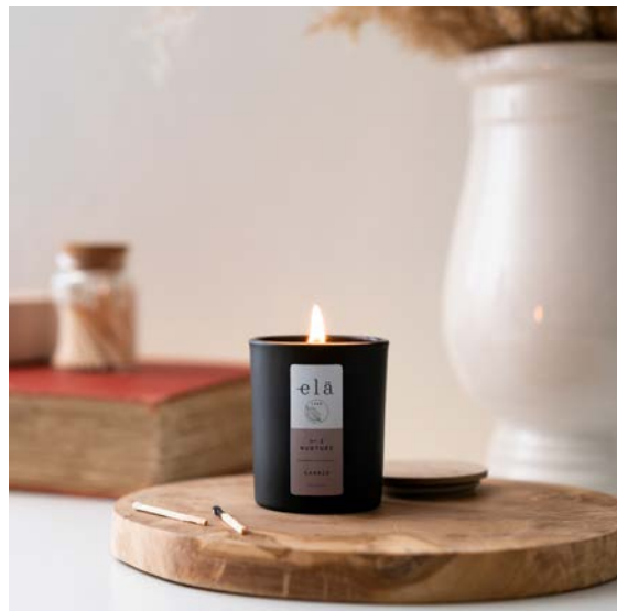
nurture no 2 votive 90g 3.5oz) 21VC02 rrp £12.50 trade £5 minimum order 6