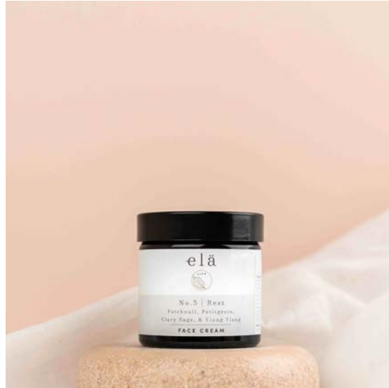
nude no 0 green tea face cream 250ml 20CR00 rrp £10 trade £3.50 minimum order 6