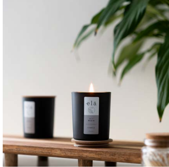
begin no 1 votive 90g (3.5oz) 21VC01 rrp £12.50 trade £5 minimum order 6