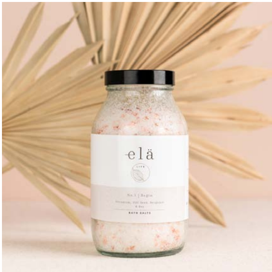
begin no 1 bath salts 500ml 20BA01 rrp £22 trade £9.50 minimum order 6