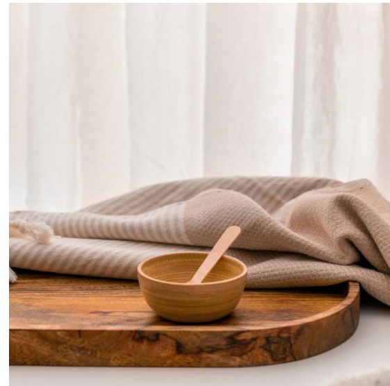
bamboo bowl 4x8cm 20B2AC rrp £5 trade £2.20 minimum order 6