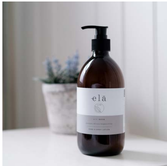
begin no 1 hand & body lotion 500ml 22L501 rrp £30 trade £12.20 minimum order 6