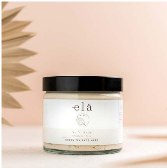
nude no 0 green tea face mask 250ml 20GT00 rrp £32 trade £12.50 minimum order 6