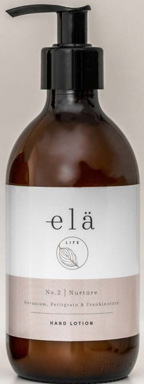
nurture no 2 hand lotion 300ml 20L302 rrp £20 trade £8.20 minimum order 6