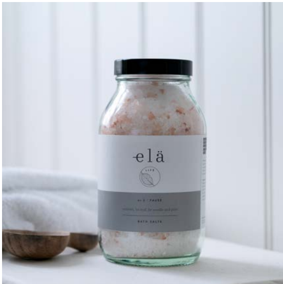
pause no 3 bath salts 500ml 22BA03 rrp £22 trade £9.50 minimum order 6