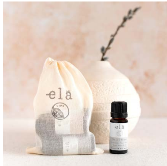
pause no 3 aromatherapy diffuser blend 10ml 20AR03 rrp £14 trade £5.25 minimum order 6