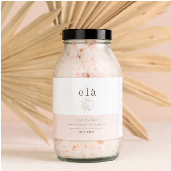
nurture no 2 bath salts 500ml 20BA02 rrp £22 trade £9.50 minimum order 6