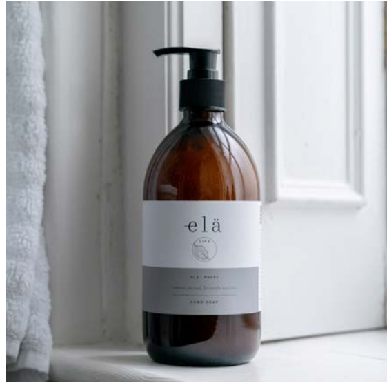
pause no 3 hand soap 500ml 22S503 rrp £30 trade £12.20 minimum order 6