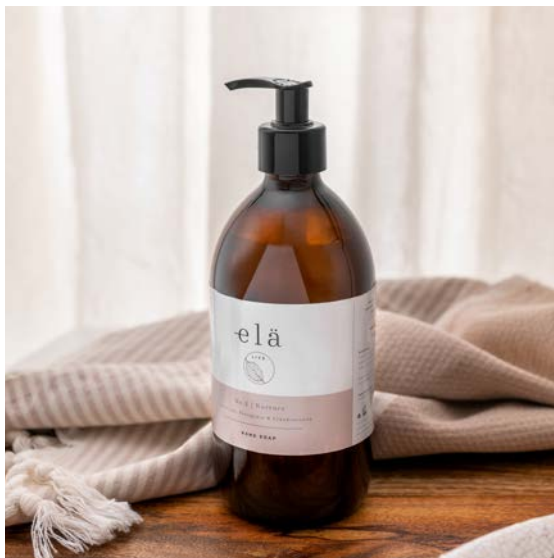
nurture no 2 hand soap 500ml 20S502 RRP £30 trade £12.20 minimum order 6