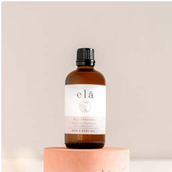
nurture no 2 bath & body oil 150ml 20BB02 rrp £18 trade £7.50 minimum order 6