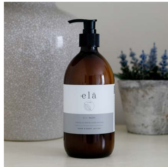
pause no 3 hand & body lotion 500ml 22BA03 rrp £30 trade £12.20 minimum order 6