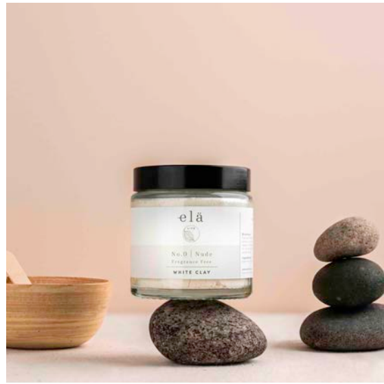
nude no 0 kaolin white clay mask 120ml 20WM00 rrp £22 trade £9 minimum order 6