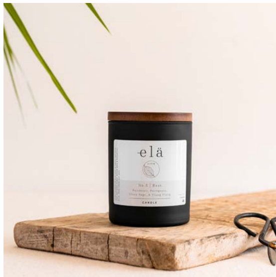
rest no 5 candle 200g (7oz) 20CA05 rrp £26 trade £10.70 minimum order 6