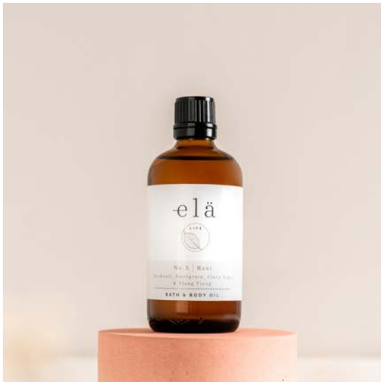
rest no 5 bath & body oil 150ml 20BB05 rrp £18 trade £7.50 minimum order 6