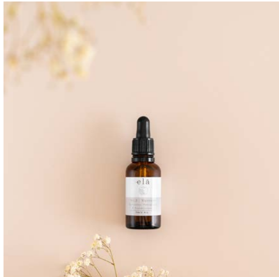
nurture no 2 face oil 30ml 20FO02 rrp £12 trade £4.20 minimum order 6