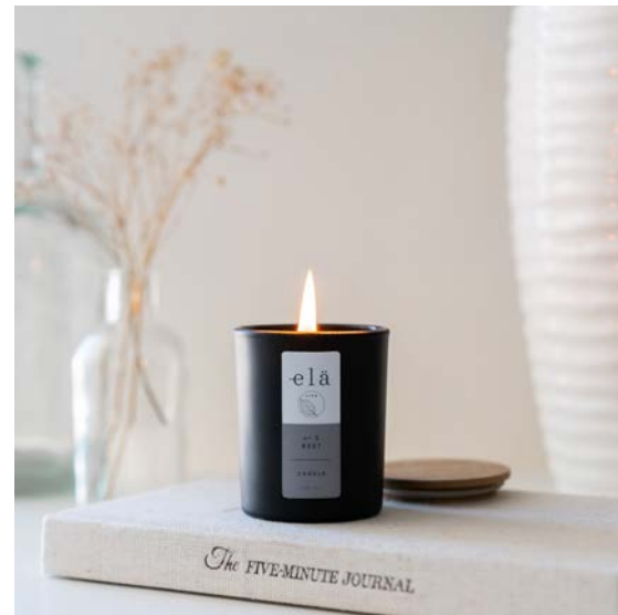
rest no 5 votive 90g (3.5oz) 21VC05 rrp £12.50 trade £5 minimum order 6