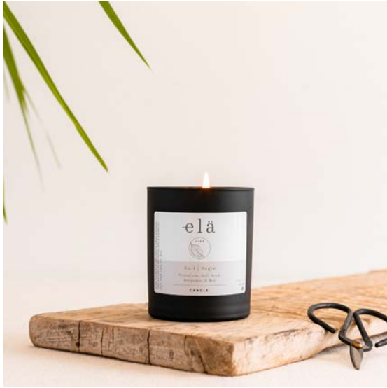
begin no 1 candle 200g (7oz) 20CA01 rrp £26 trade £10.70 minimum order 6