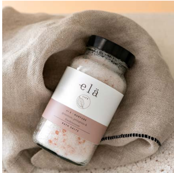
nurture no 2 bath salts 250ml 21BM02 rrp £12 trade £4.50 minimum order 6