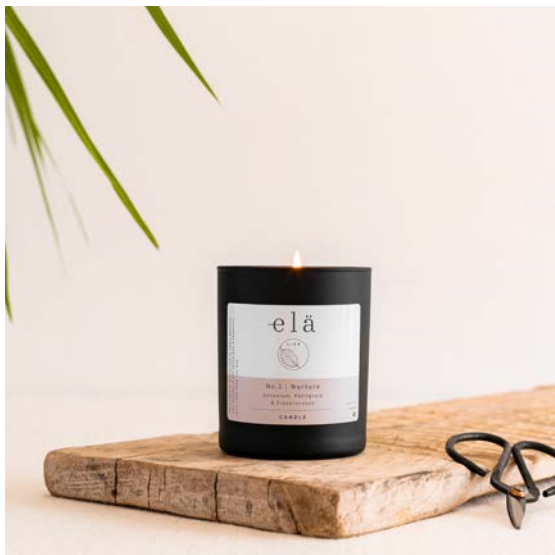
nurture no 2 candle 200g (7oz) 20CA02 rrp £26 trade £10.70 minimum order 6