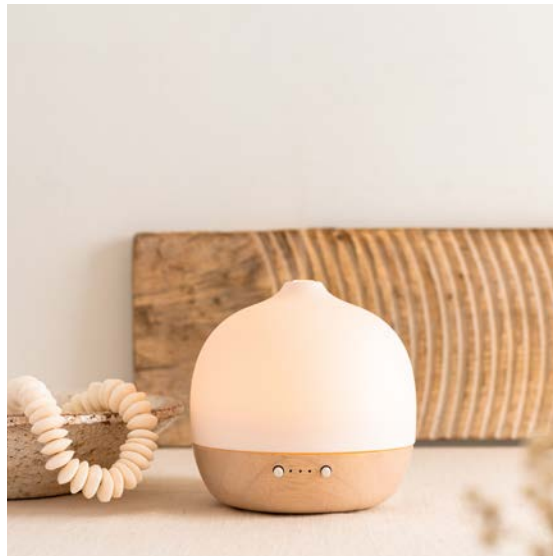
electric diffuser lamp ceramic and bamboo 20EDAC rrp £78 trade £35 minimum order 6