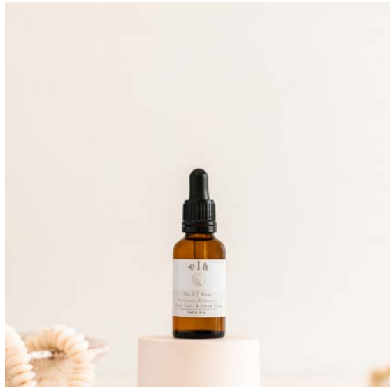
rest no 5 face oil 30ml 20FO05 rrp £12 trade £4.20 minimum order 6