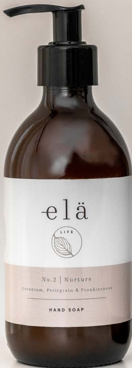
nurture no 2 hand soap 300ml 20S302 rrp £20 trade £8.20 minimum order 6