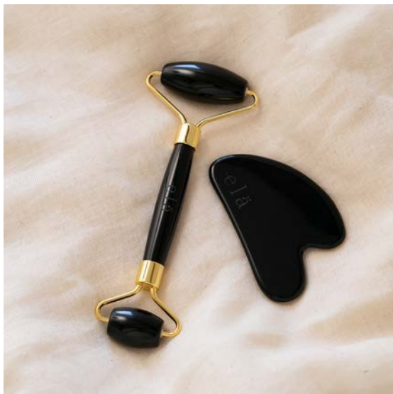
black obsidian gua sha & facial roller set 21BOAC rrp £43 trade £15.50 minimum order 6