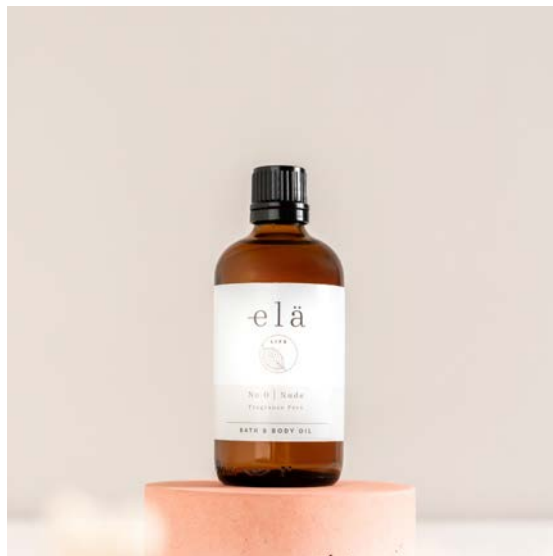
nude no 0 bath & body oil 100ml 20BB00 rrp £15 trade £6.20 minimum order 6