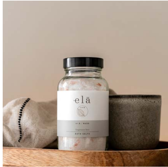
nude no 0 bath salts 250ml 21BM00 rrp £8 trade £3 minimum order 6