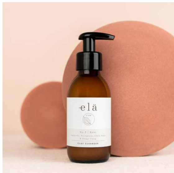
rest no 5 clay cleanser 150ml 20CL05 rrp £16 trade £6.50 minimum order 6