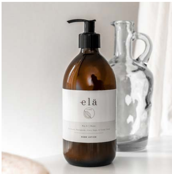
rest no 5 hand & body lotion 500ml 20L505 rrp £30 trade £12.20 minimum order 6