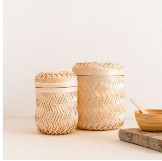
bamboo set of 2 baskets 15x11.5/ 12.5x9cm 20BAAC rrp £18 trade £6.80 minimum order 6