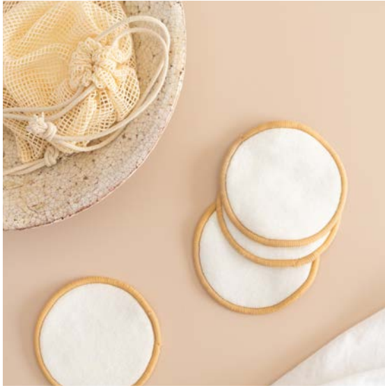
reusable skincare pads set of 10 20FPAC rrp £16 trade £7.50 minimum order 6