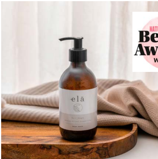
begin no 1 body wash 300ml 20B301 rrp £20 trade £8.20 minimum order 6