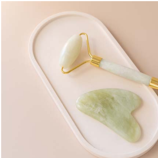
xiujian jade gua sha & facial roller set 21XJAC rrp £43 trade £15.50 minimum order 6