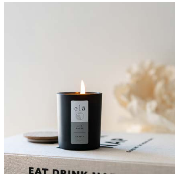
pause no 3 votive 90g (3.5oz) 21VC03 rrp £12.50 trade £5 minimum order 6