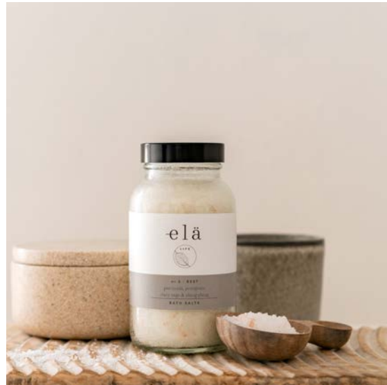
rest no 5 bath salts 250ml 21BM05 rrp £12 trade £4.50 minimum order 6