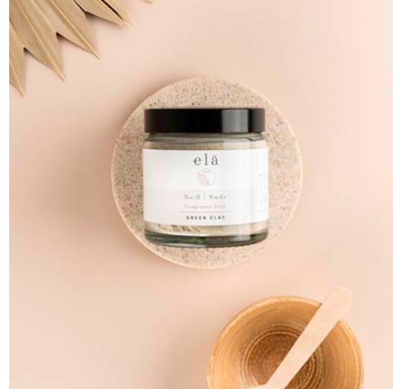
nude no 0 french green clay mask 120ml 20FG00 rrp £22 trade £9 minimum order 6