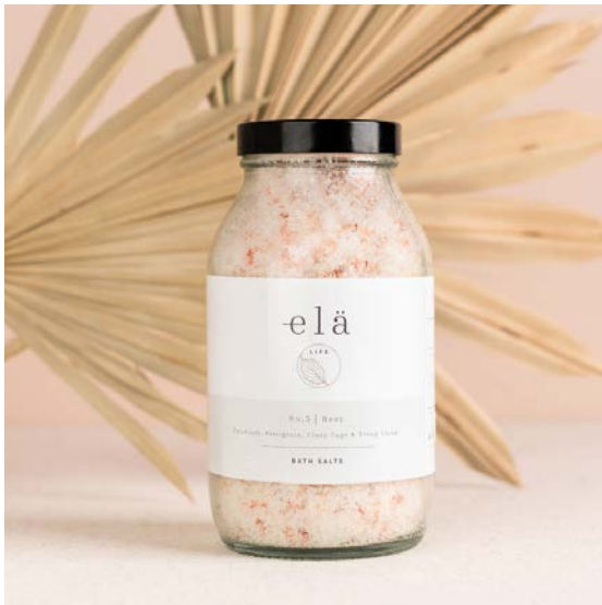
rest no 5 bath salts 500ml 20BA05 rrp £22 trade £9.50 minimum order 6