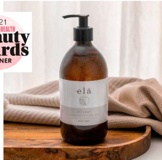
begin no 1 body wash 500ml 20B501 rrp 30 trade £12.20 minimum order 6