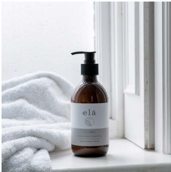
begin no 1 hand & body lotion 300ml 22L301 rrp £20 trade £8.20 minimum order 6