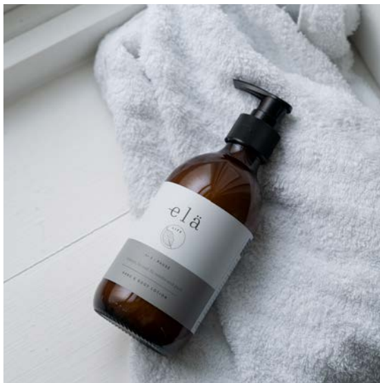
pause no 3 hand & body lotion 300ml 22BA03 rrp £20 trade £8.20 minimum order 6