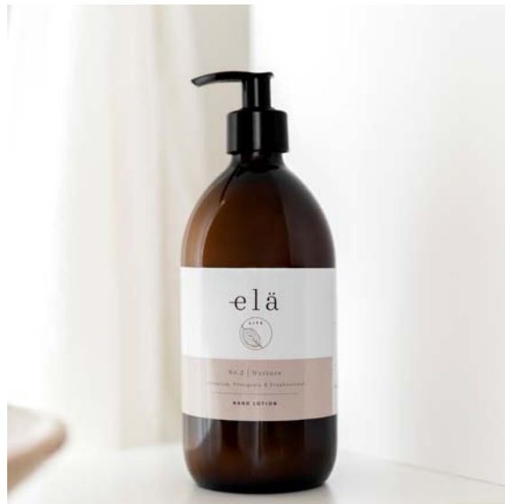
nurture no 2 hand lotion 500ml 20L502 rrp £30 trade £12.20 minimum order 6