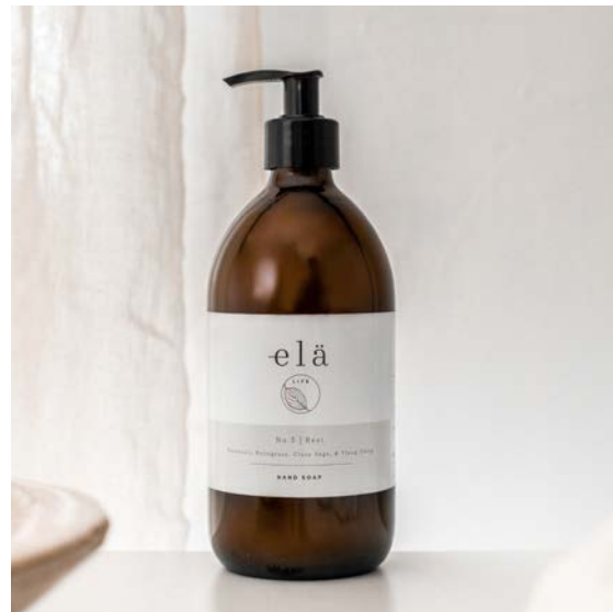
rest no 5 hand soap 500ml 20S505 rrp £30 trade £12.20 minimum order 6