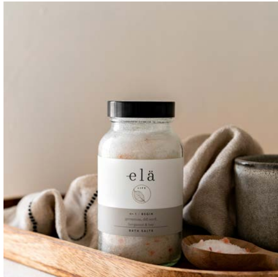
begin no 1 bath salts 500ml 21BM01 rrp £12 trade £4.50 minimum order 6