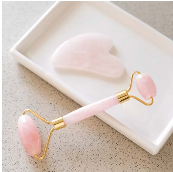
rose quartz gua sha & facial roller set 21RQAC rrp £43 trade £15.50 minimum order 6