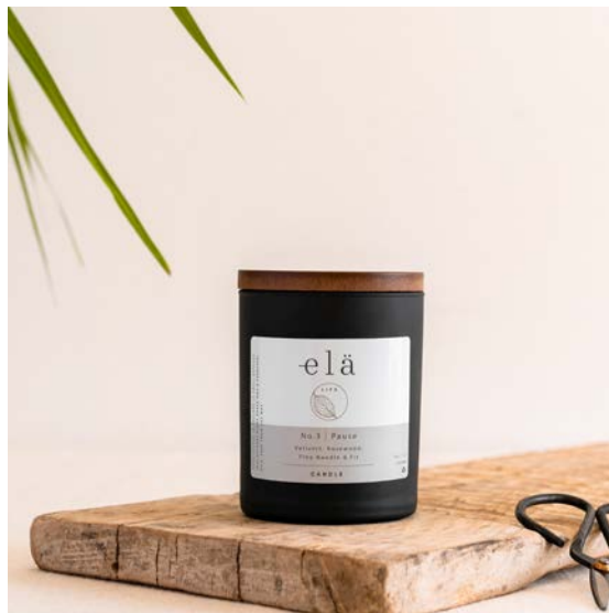
pause no 3 candle 200g (7oz) 20CA03 rrp £26 trade £10.70 minimum order 6