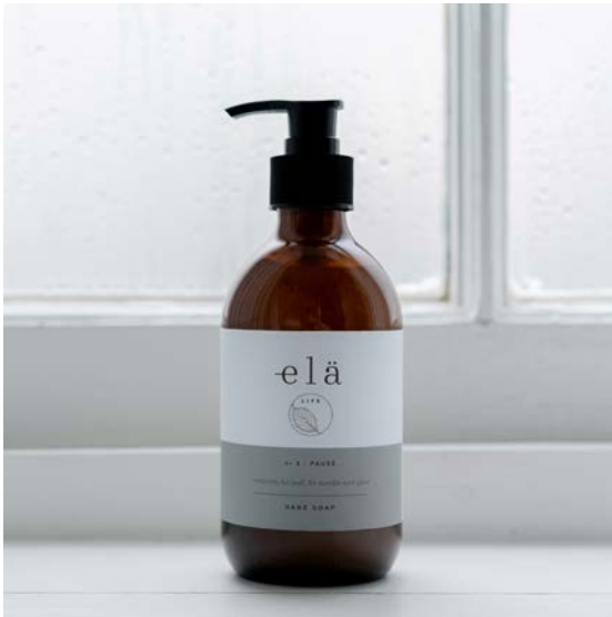
pause no 3 hand soap 300ml 22BA03 rrp £20 trade £8.20 minimum order 6