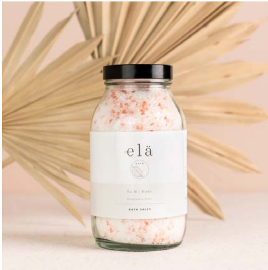
nude no 0 bath salts 500ml 20BA00 rrp £16 trade £6.20 minimum order 6