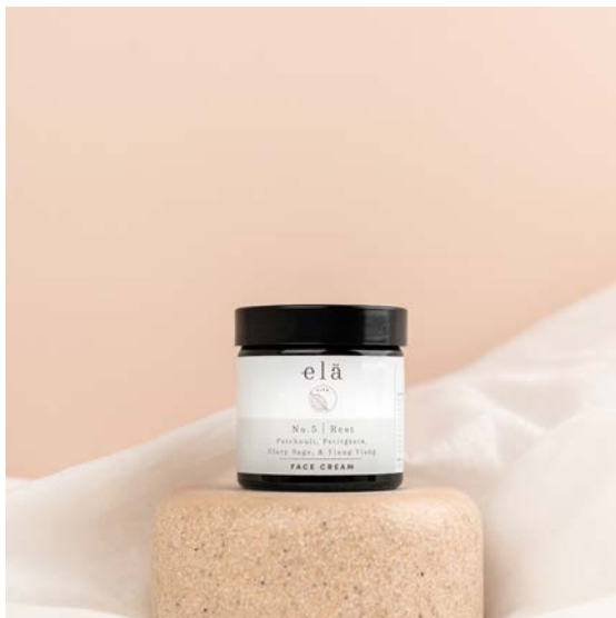
rest no 5 face cream 60ml 20CR05 rrp £14 trade £4.50 minimum order 6